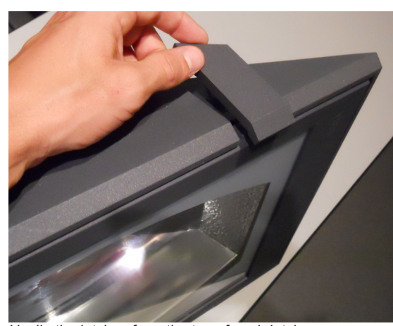
Unclip the latches from the top of each latch