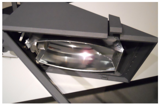
Lens cover frame will swing down after latches unclip